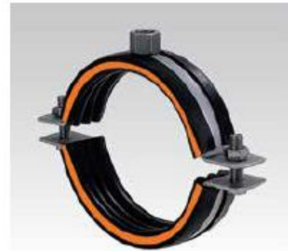
With DÄMMGULAST® Junior